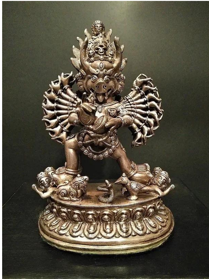
Silver Vajrabhairava – Solitary Hero, Tibet